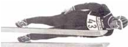
Jumper in Planica, the venue of the first ski jump over 100 m (1936).

The comfort of success is the reward for a history of hard, dutiful work. Decisively and courageously we are setting the limits of the possible ever higher.