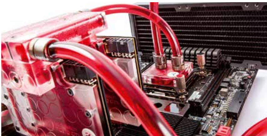
EKWB cooling setup with CPU water block

Continuous development and innovation in ICT lead to original technological solutions that are commonly integrated into the company's work environment and processes. Not only are they connecting people but they're also becoming an indispensable part of the operations of successful companies around the world today.