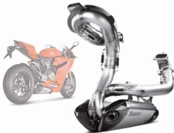
Akrapovič Evolution Line (Titanium) for the Ducati 1199 Panigale

Slovenian companies don't stop to ask for directions – they know where they're going. The automotive industry's migration to a built-to-order manufacturing process means that components are delivered to automakers and their Tier One suppliers in sequence to manufacturing. Actively involved in international partnerships and providing customized products, Slovenian companies are ever more innovation-oriented.