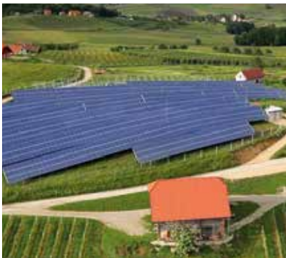
Photovoltaic power plant Buče / PV modules by BISOL • www.bisol.com

We're following the country's most noticeably abundant colour – green. Energy supply is unequivocally reliable, and by the year 2020, at least 20% of energy generated and used will derive from sustainable sources.