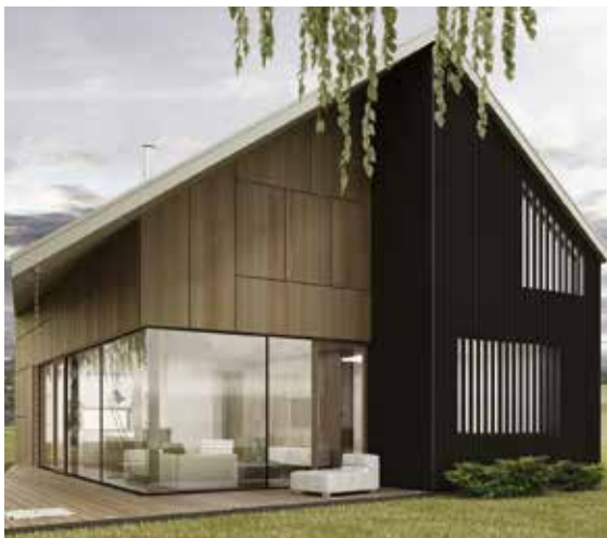
Lumar Black Line Pure S / LUMAR • www.lumar.si