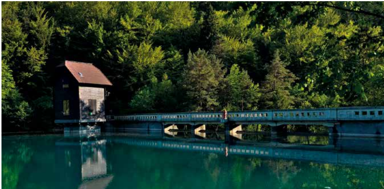
Hydroelectric power plant Moste, basin Završnica • www.sel.si