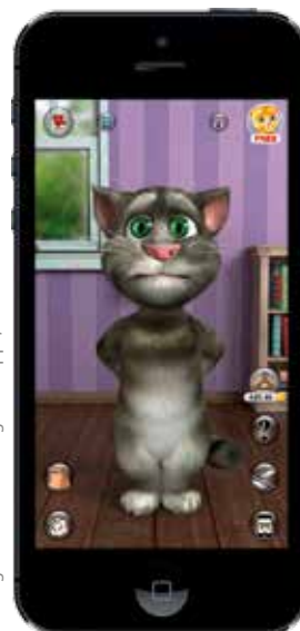
Talking Friends - Talking Tom app / Outfit7 • www.outfit7.com