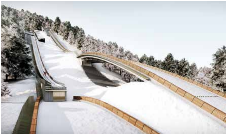
A scene from Planica today.

The comfort of success is the reward for a history of hard, dutiful work. Decisively and courageously we are setting the limits of the possible ever higher.