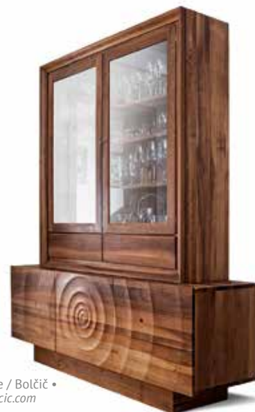
Furniture / Bolčič • www.bolcic.com