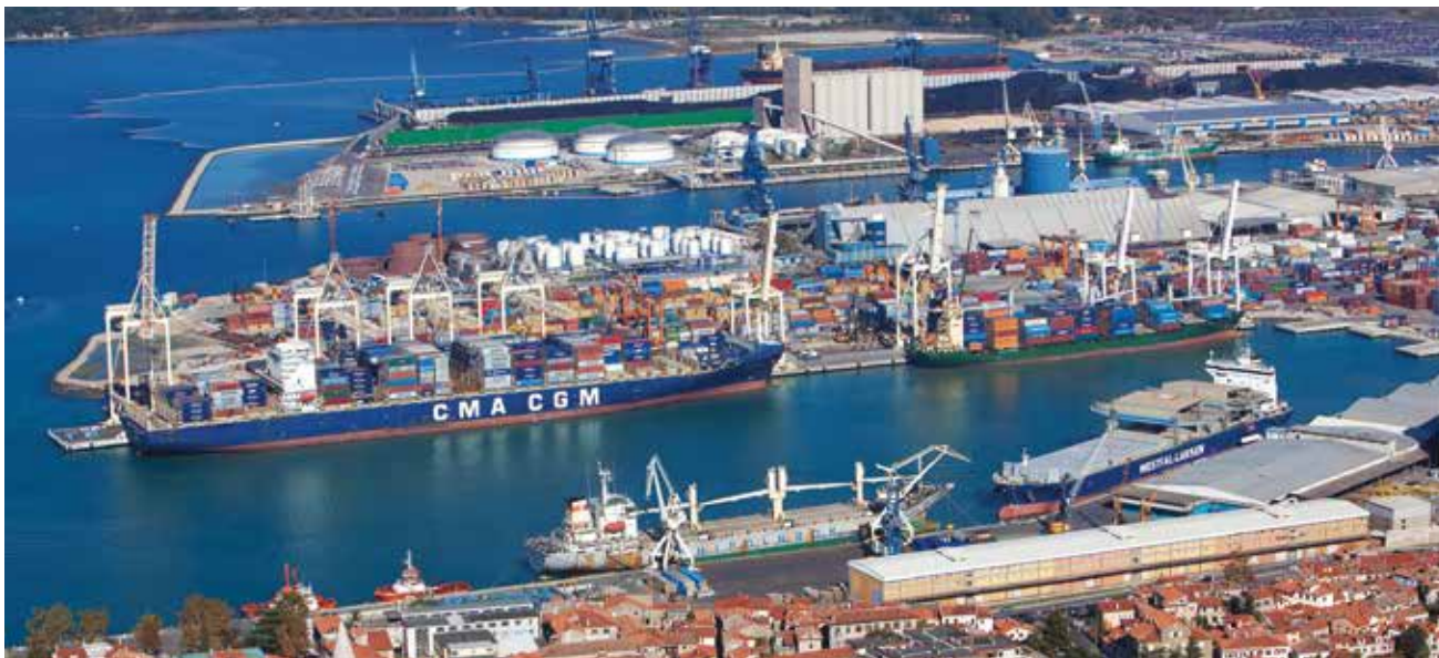
Port of Koper / Luka Koper • www.luka-kp.si