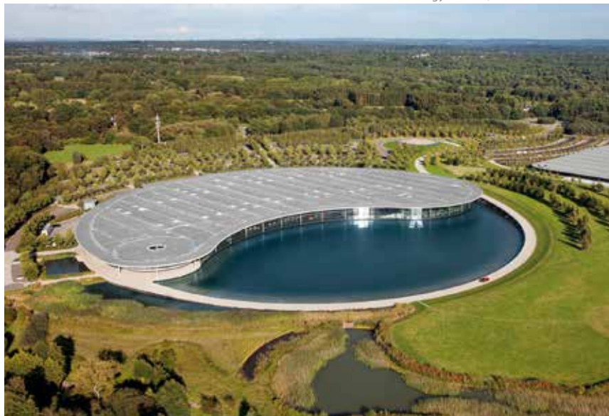
McLaren Technology Centre

The impact of construction on both the environment and on sustainable development, together with construction ecology, are well taken into account in town planning processes. A proven track record of Slovenian builders and engineers makes them ideal partners for meeting clients' objectives the world over.