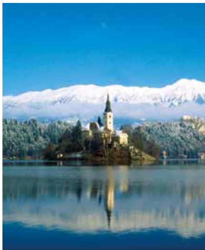
The natural island on lake Bled