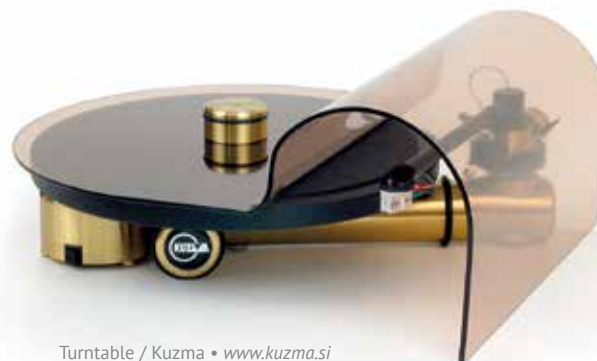
Turntable / Kuzma • www.kuzma.si

A quick look inside homes, offices and sports and recreation centers, down at the roads, out at the sea and the sky beyond, reveals a surprising number of quality, widely-recognized Slovenian brands and products. Who knows, you may even already have one.