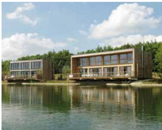
Housing estate of 160 houses in Oxford / RIKO • www.riko-hise.si