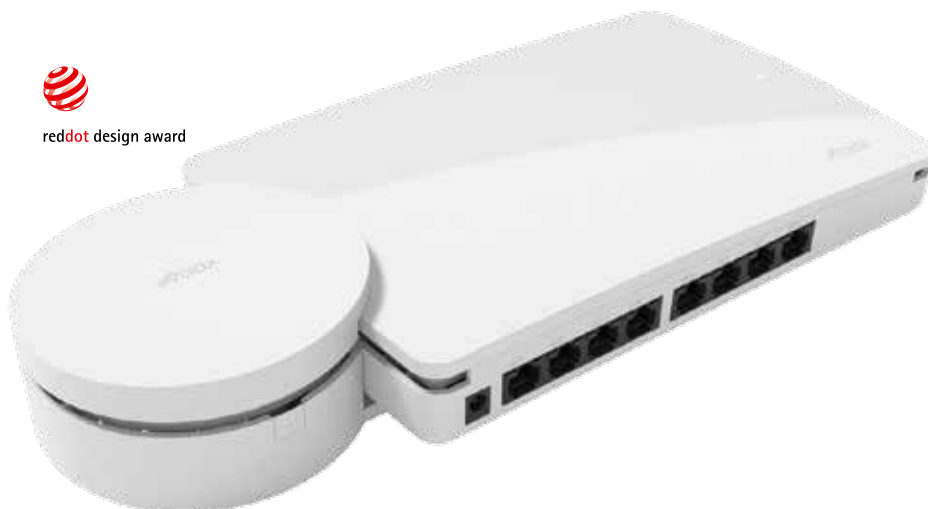
Network extension / Innbox (Iskratel) • www.innbox.net