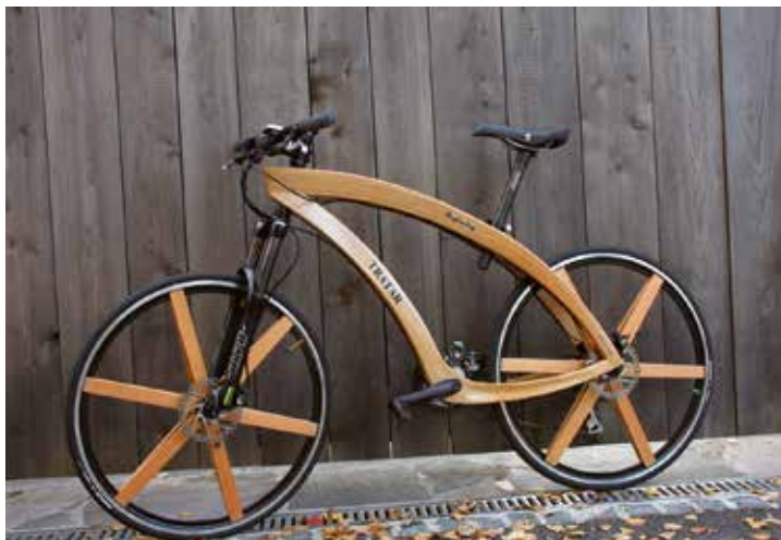
Tratar wooden bike • www.mizarstvotratar.si