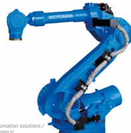
Yaskawa Ristro innovative robotic automation solutions / Motoman • www.motoman.si

A shift from batch production to a build-to-order strategy has removed the barriers between machining and the rest of manufacturing. Industrial robots have been taking over the most cumbersome production processes. Similarly, state of the art equipment empowers highly-skilled workforces. And Slovenia's long industrial tradition has taught us how to make the pieces fit together—just right.