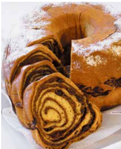
Potica, a traditional Slovenian festive cake