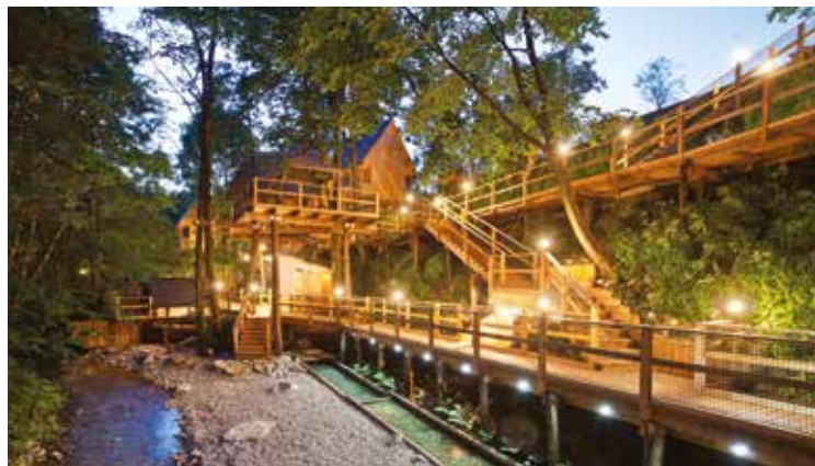
Tree houses in Garden Village, Bled / Tesarstvo Erman • www.tesarstvo-erman.si