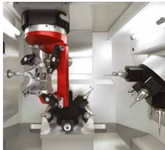
Flexible centre end facing machine / Unior • www.unior.si