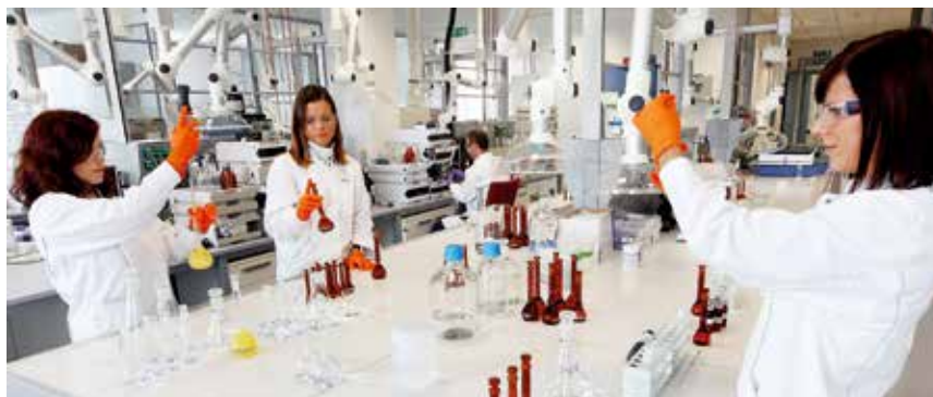
Research and development centre in pharmaceutical company / Krka d.d. • www.krka.si

Research work with wider international recognition, cooperation between the pharmaceutical and biochemical industries, and the trust of multinational corporations, have earned Slovenia a high position among the largest manufacturers of pharmaceuticals in Central and Eastern Europe.