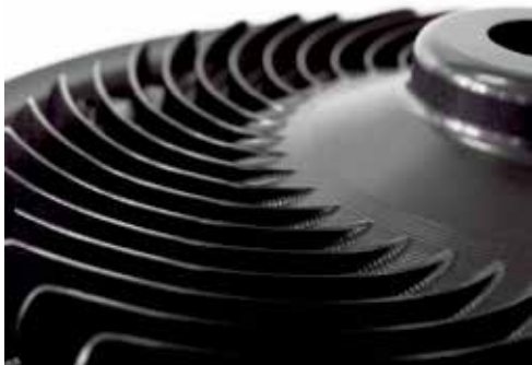
In-wheel electric drive / Elaphe • www.in-wheel.com