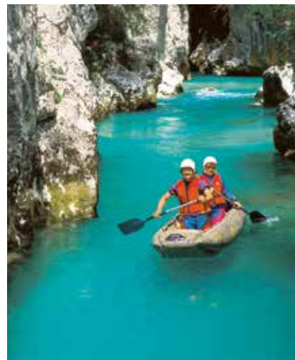
Rafting on pristine Soča river