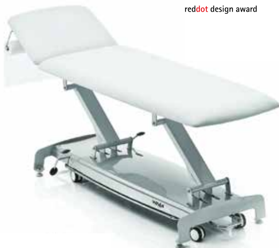
Examination table S / Novak M • www.novak-m.si