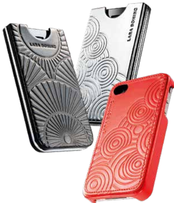
Calypso Case designed by Lara Bohinc / Calypso Crystal • www.calypsocrystal.com