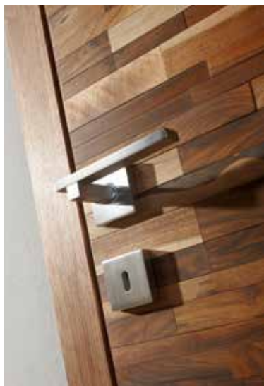
Recycled door / MELU • www.mizarstvo-selisnik.si

R ich forests that provide high quality timber cover more than half of the country, where wood has played an integral role in Slovenian tradition and production for centuries. Quality craftsmanship, together with a dedicated wood industry, enjoys a long tradition of employing wood in construction, furniture manufacture and a bounty of everyday objects. Strong, contemporary design, innovation and high quality raw materials and processes combine to form the best foundations for the emergence of a host of compelling products and services to come.