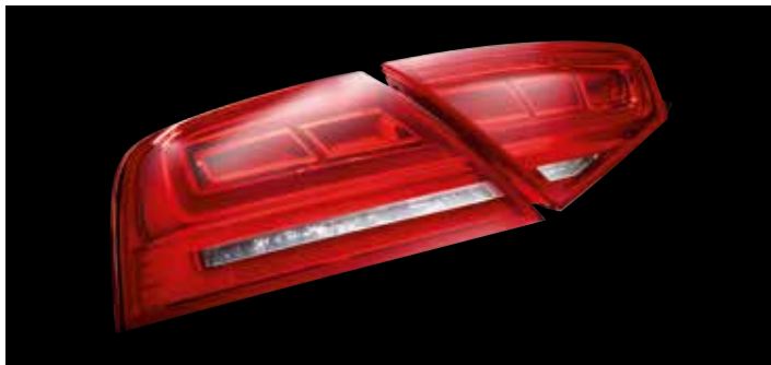
LED car lights / Odelo • www.odelo.si