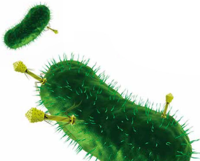
Phages production process, biosolutions / Jafra • www.jafra.com