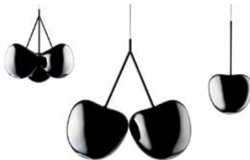
Black cherries lights family / Nika Zupanc • www.nikazupanc.com