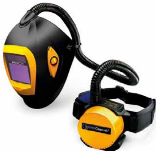
Clean Air welding helmet / Balder • www.balder.si