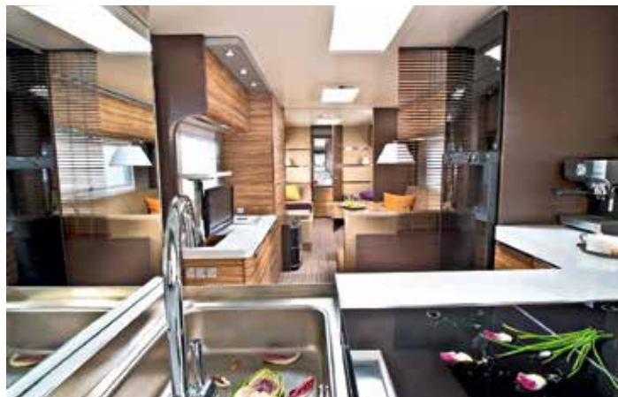
"Astella Glam" edition motorhome / Adria Mobil • www.adria-mobil.com