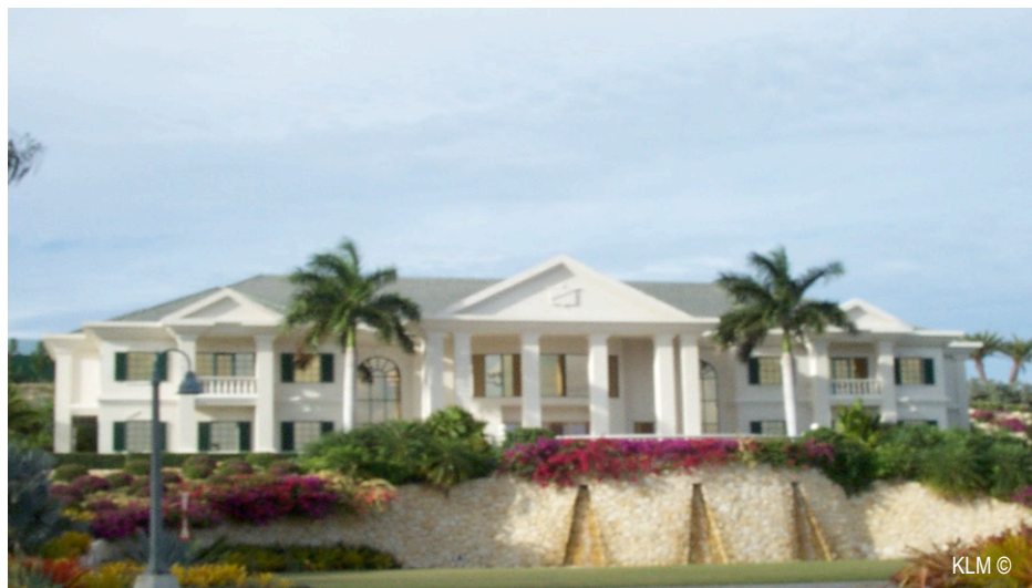
Photograph 17: Stanford International Bank