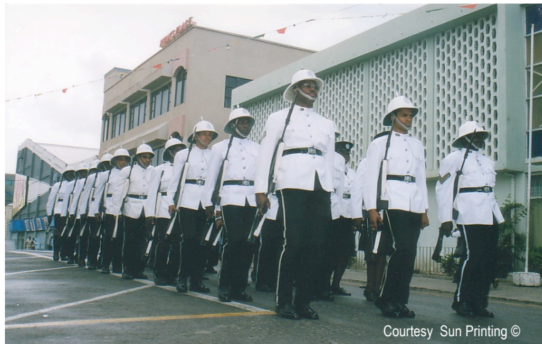
Photograph 16: Antigua Police Force

P.O. Box 767, Eton Chambers, Cnr. Nevis & Temple Streets St. Johns, Antigua, WI (268) 462-9474 / 4226 (Tel) (268) 462-1274 (Fax)