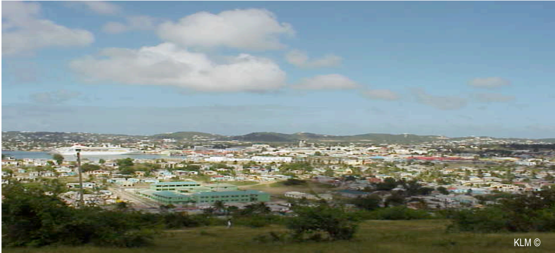
Photograph 1: Overview of St. John's