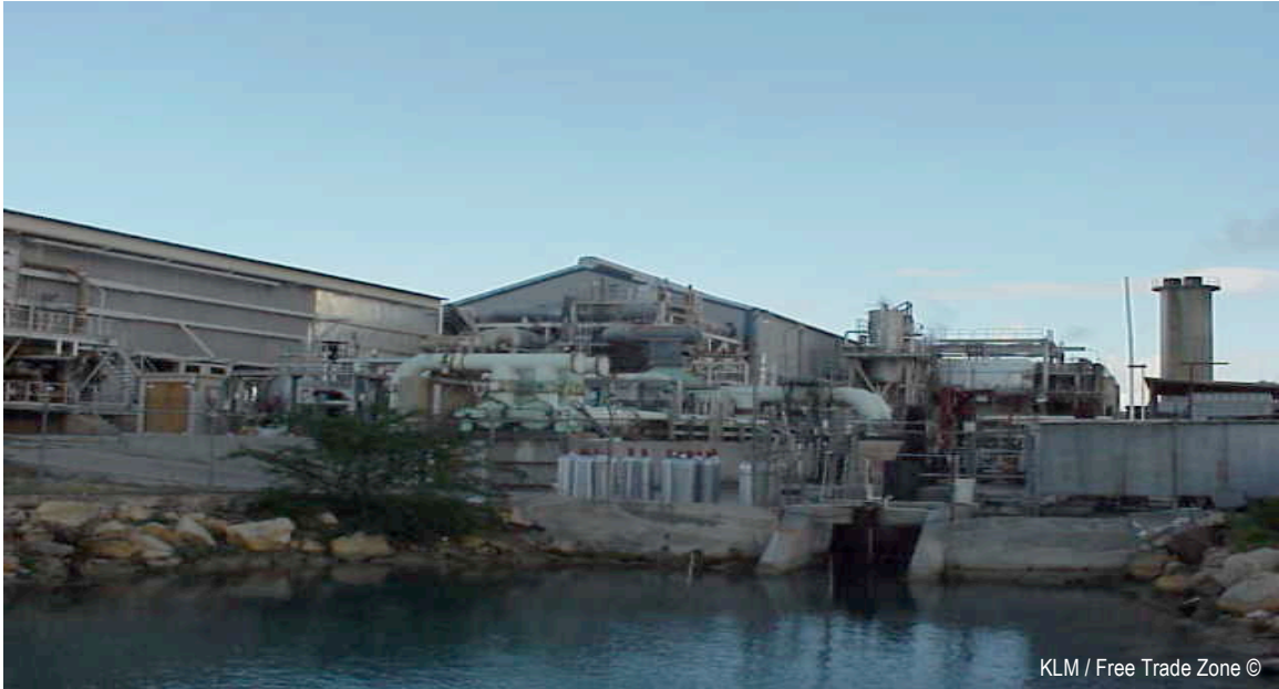
Photograph 5: Desalination Plant