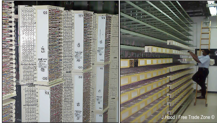
Photograph 3: Overview of Cable & Wireless