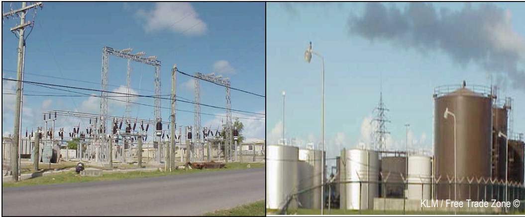
Photograph 4: Energy Sources