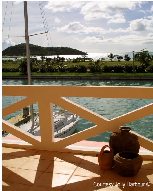
Photograph 11: Jolly Harbour Villas

2 In June 1995, the government introduced a permanent residence scheme to encourage a limited number of high net worth individuals to establish tax residency in Antigua and Barbuda. As residents all their income would be free of local tax.