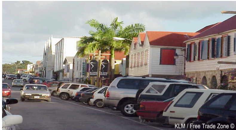
Photograph 18: Redcliffe Street