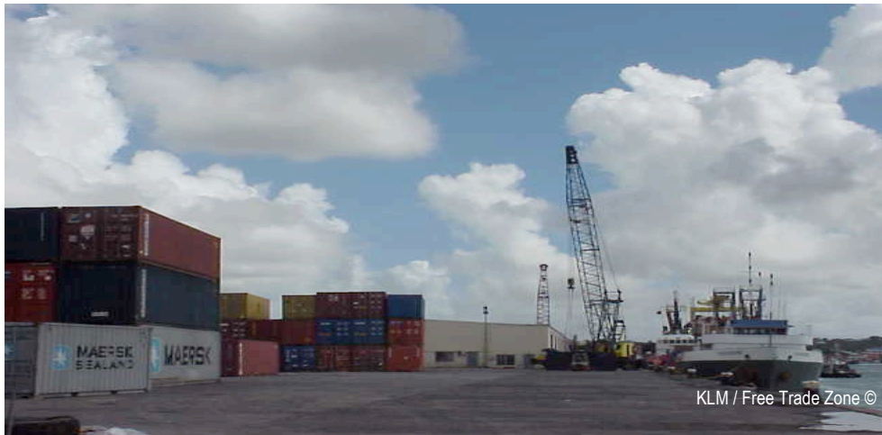
Photograph 22: Overview of Deep Water Harbour