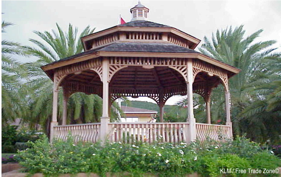
Photograph 15: Gazebo at Jolly Harbour

P.O Box W929, Soldier Bay, St. John's, Antigua, WI (268) 461 – 5541 (Tel) (268) 463 – 0579 (Fax) E-mail: debfish@candw.ag