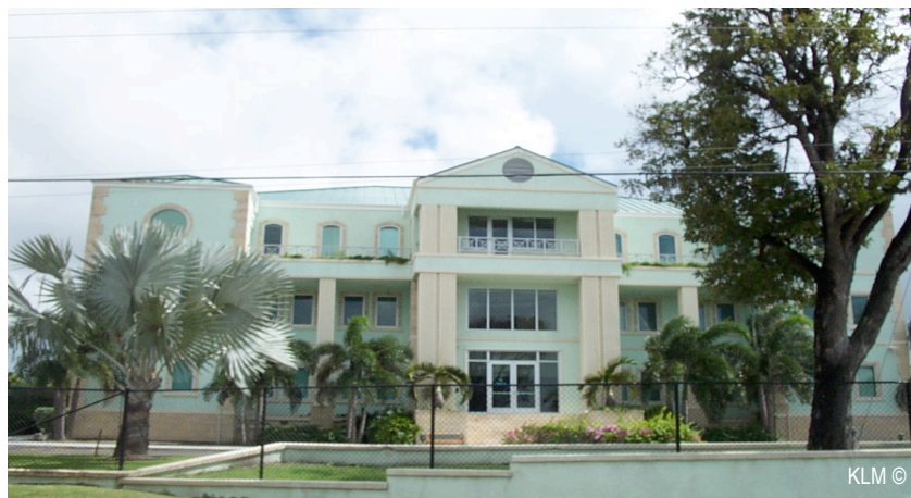
Photograph 20: Sagicor Financial Centre