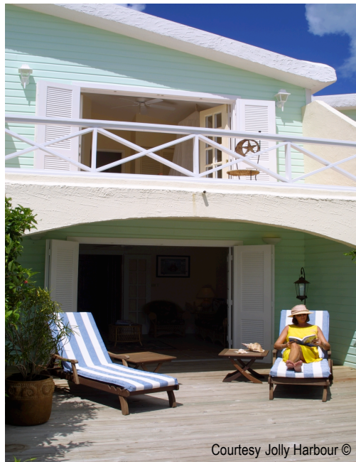
Photograph 13: Villas at Jolly Harbour

Most of the amenities that expatriates are accustomed to are easily available in Antigua and Barbuda.