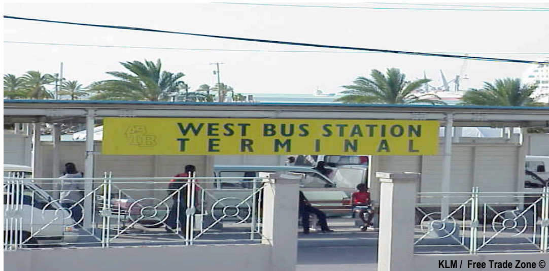
Photograph 12: West Bus Station Terminal

There are several ways of getting around Antigua – Taxis, Buses, Rental Cars, Scooters, Motorbikes or Bicycles.