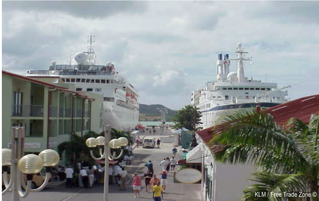
Photograph 6: Overview of Heritage Quay

Antigua and Barbuda is a signatory to the following trade agreements. As part of the Free Trade and Processing Zone, investors may access regional and international markets through the following trade agreements: