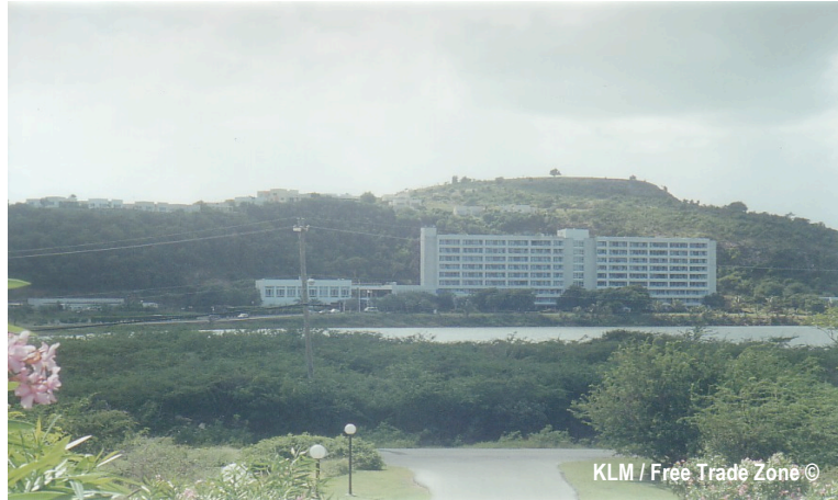
Photograph 19: Royal Antigua Resort