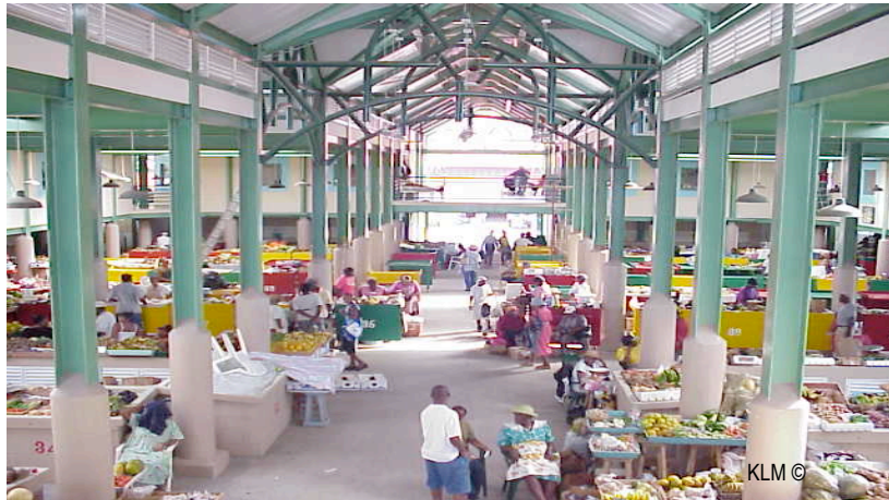
Photograph 14: St. John's Public Market